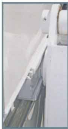
Slide shoe in polymer