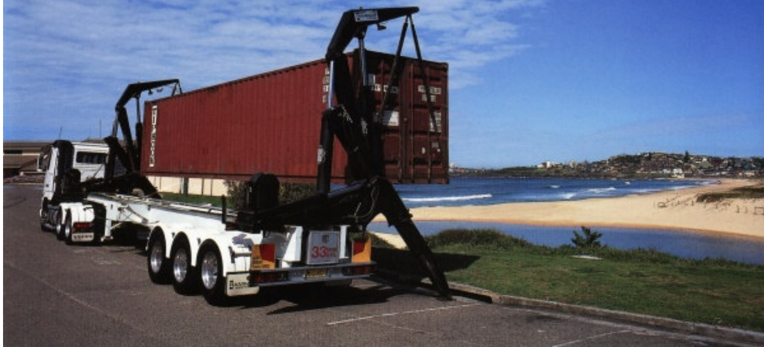
Port of Göteborg